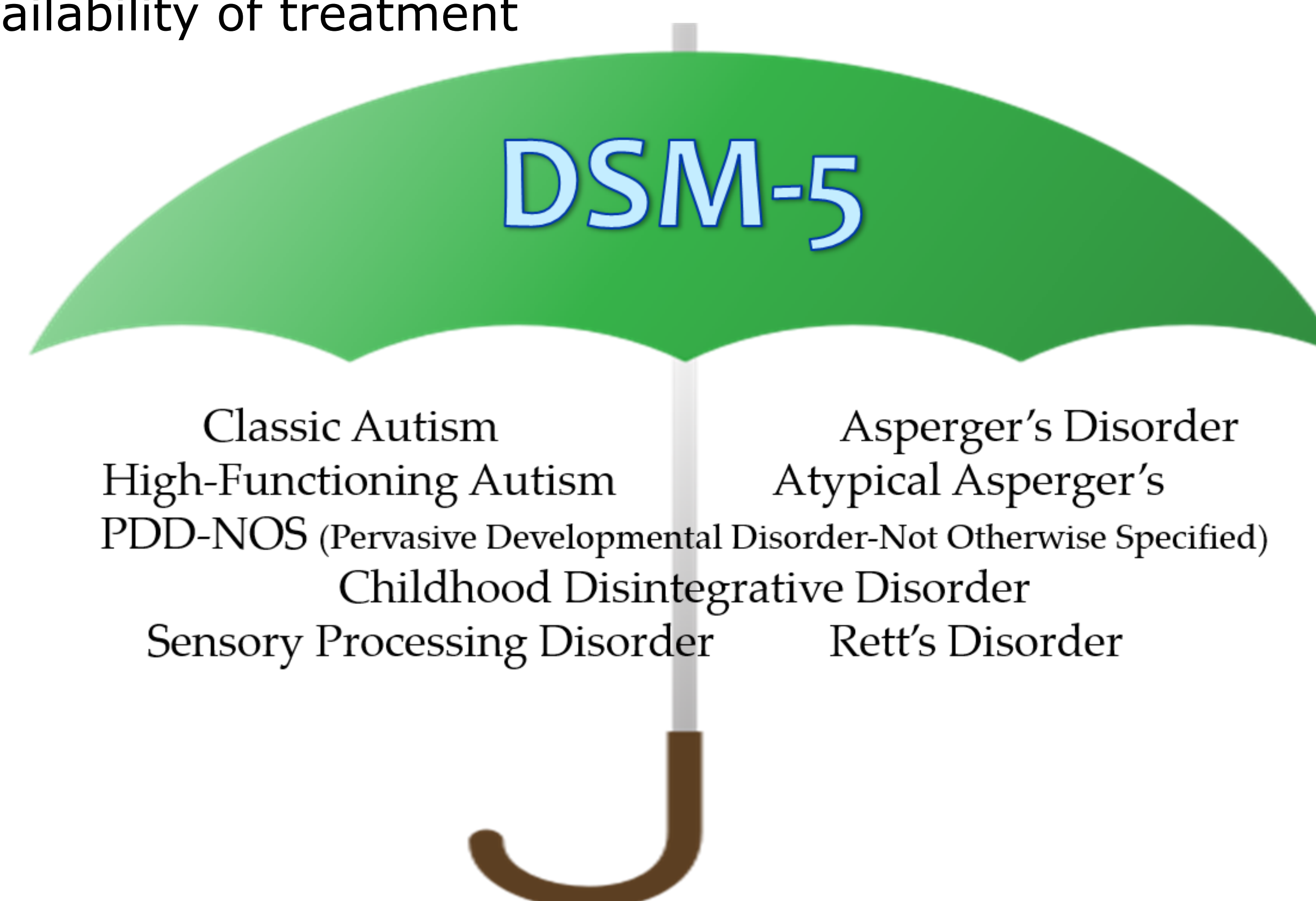
[a green umbrella with DSM-5 printed on it with all of the conditions that make up autism spectrum disorder beneath it]